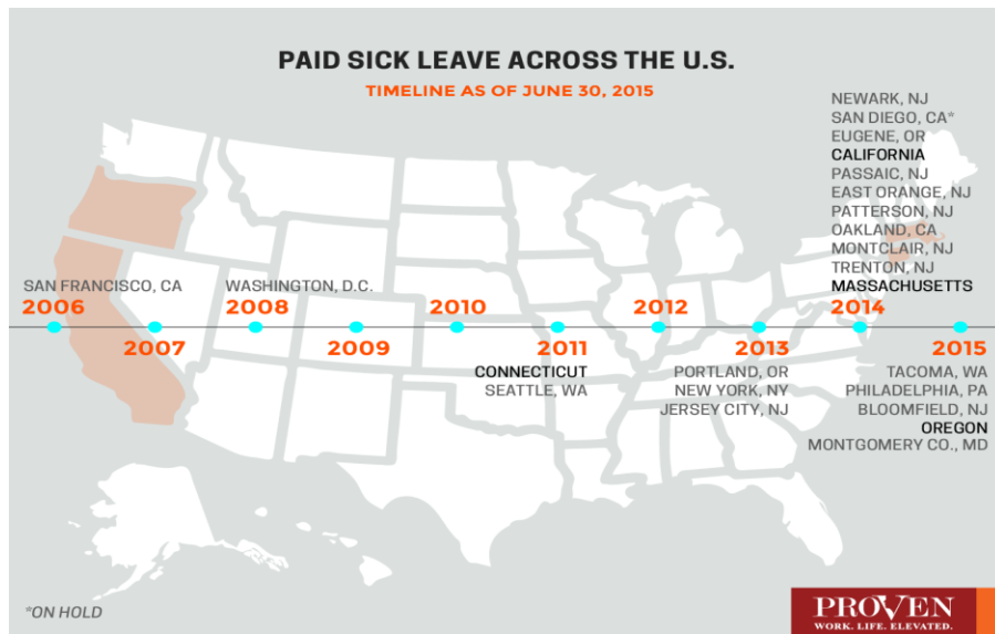
From Proven Recruiting “Everything You Need to Know About Paid Sick Leave.” 3

Around the country, an increasing number of states and cities are recognizing the importance of providing workers with paid sick days so they can take time off of work to deal with serious health problems for themselves or their family members. As of November 2015, four states, the District of Columbia, twenty one cities, and one county have passed laws giving workers paid sick time. 1 In addition, an increasing number of states and cities have paid sick days legislation on the ballot or campaigns to enact such legislation. 2